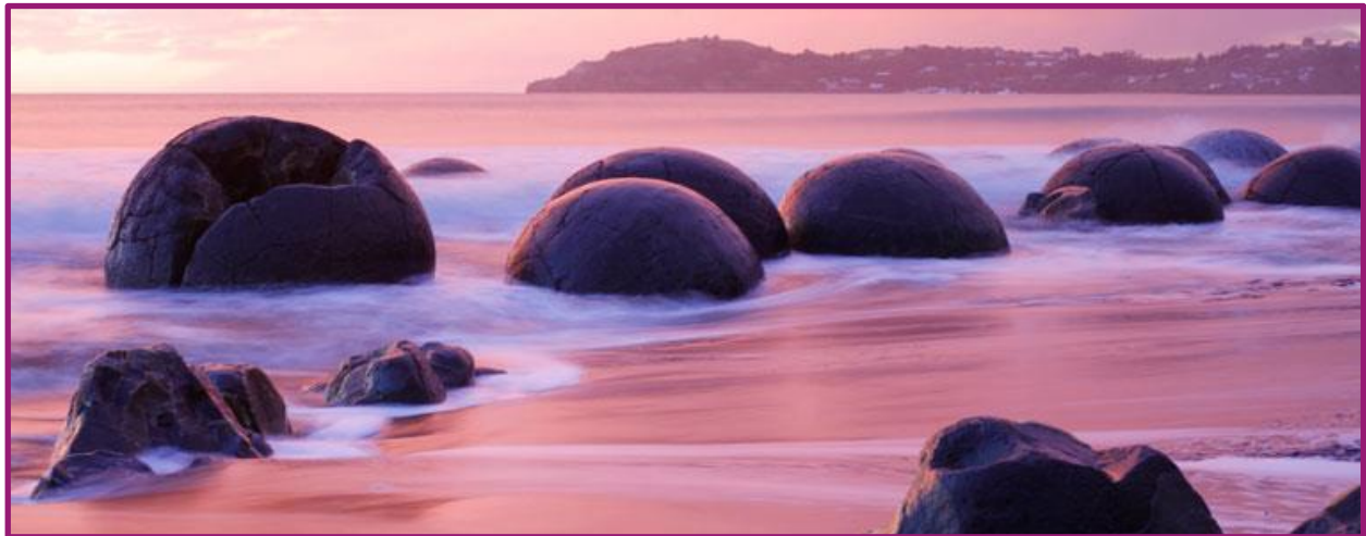
Moeraki Boulders, Waitaki Whitestone Aspiring Global Geopark

Waitaki Whitestone Aspiring Global Geopark, New Zealand is that country's first geopark which is going for Global Geopark status. They have an exciting website ( www.whitestonegeopark.nz ) and put out a great newsletter. The latest can be accessed at https://mailchi.mp/whitestonegeopark/june21-newsletter?e=53bfc6d9ff .