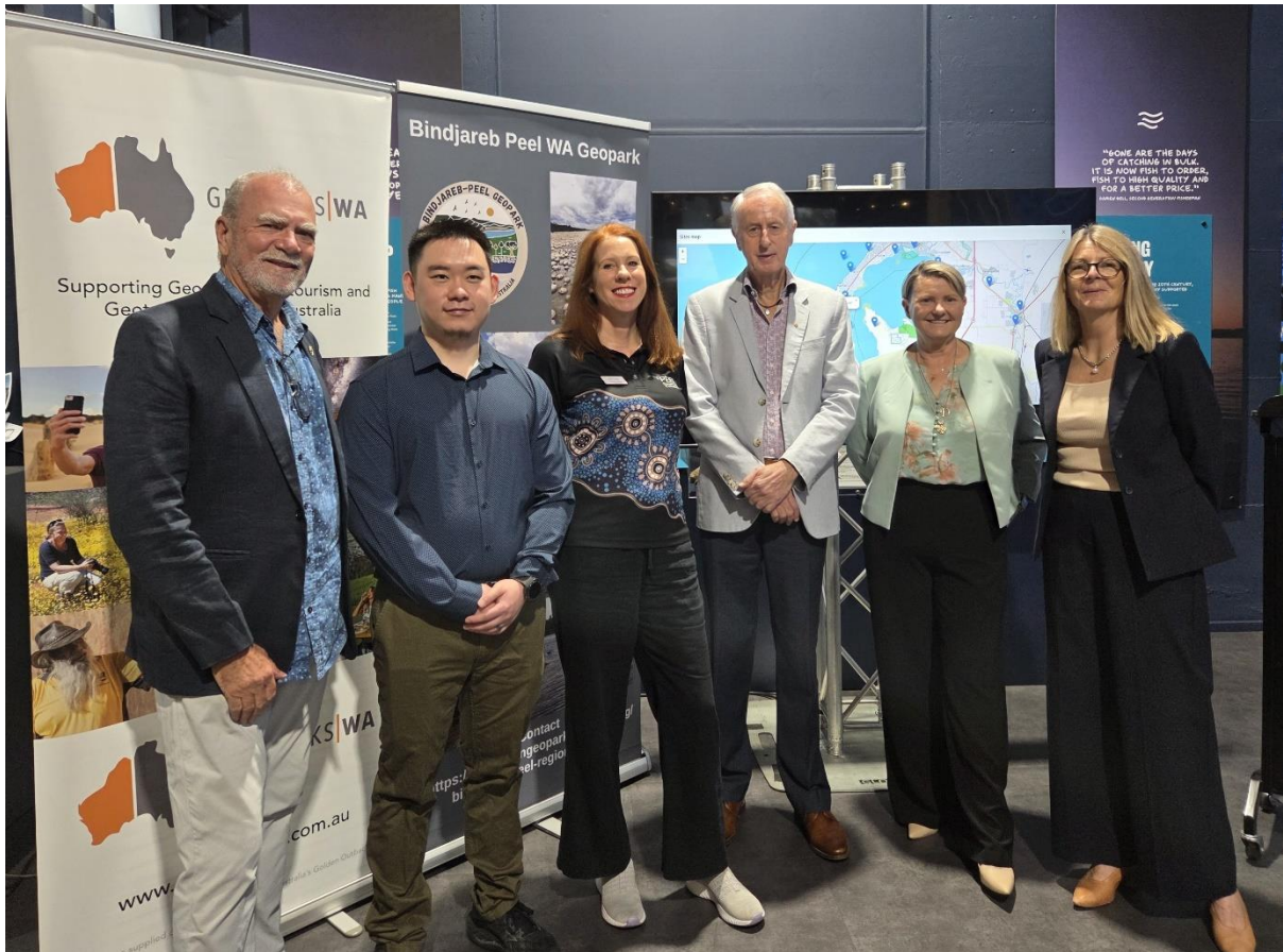
The Bindjareb team behind the geopark.